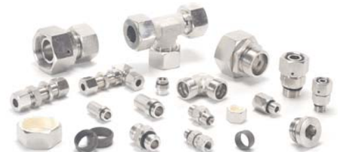
ISO 8434 / DIN 2353 Hydraulic tube couplings